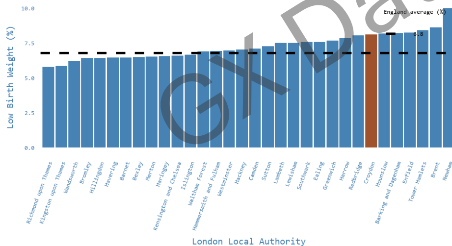
Figure 2. Low Birth Weight Birth, London Local Authorities